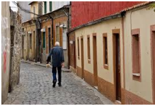
B. Ilha/ working class housing (Ilha da Lomba)

The surrounding area still shows clear signs of urban and social degradation, an issue this type of private initiative aims to address. Both contiguous buildings, dubbed the Mira space and the Mira Fórum, present two complementary schedules, one delving into experimental territories with the collaboration of young curators and artists - under the artistic direction of José Maia - and a more specific programme dedicated to photography in its multiple expressions (artistic, documental and historical).