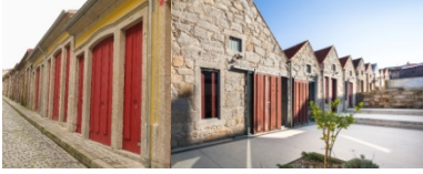
A. Espaço Mira (street/rua de Miraflor)