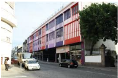
C. Centro Comercial STOP (street/rua do Heroísmo)

These groups of small houses ('ilhas') occupy an area of about 16 square metres. Usually were built along the back-gardens of middle-class houses (or which had been originally built as middle-class houses) in areas of the city that, given their proximity to industries located nearby, had begun a process of physical and social decay that would be further accentuated by the construction of these working-class houses. These houses were built either in a row, along the 5.5 or 6 metres wide urban lots, or in two rows, back-to-back or facing each other, when they occupied two of these plots.